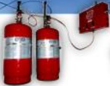
Fire Suppression System