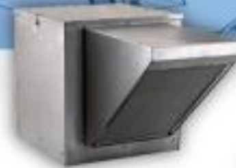
Make-up Air Fan