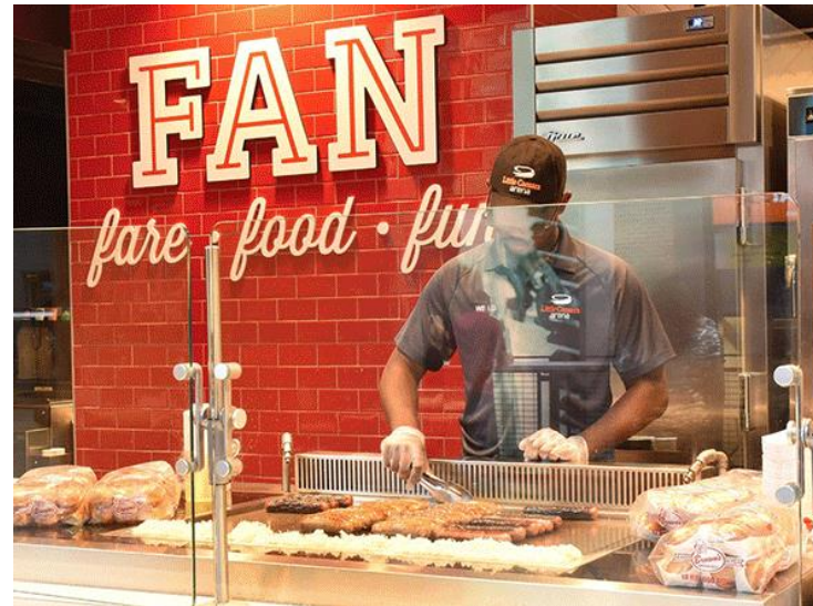
EVent® Ventless Griddle